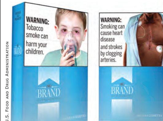
The proposed warnings would cover half the pack.

in the 2012 ruling, has also been dropped.